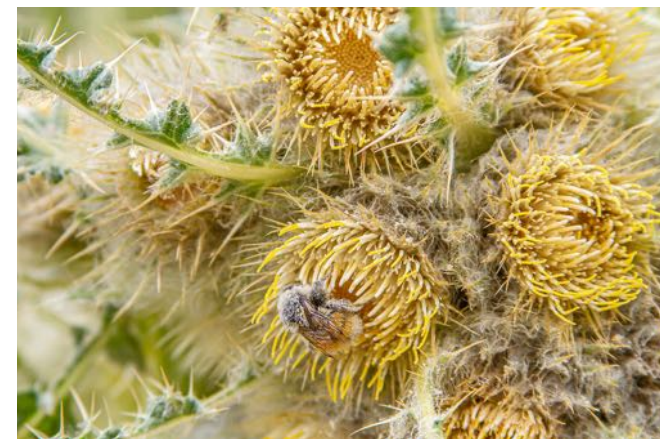
Cirsium spp. newly described species and bumble bee pollinator.

Executive Director, Betty Ford Alpine Gardens