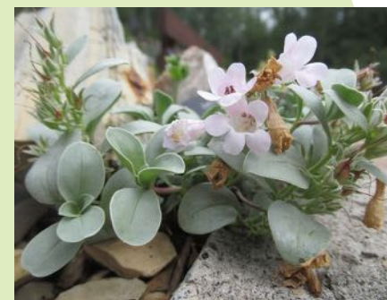
Penstemon debilis .

Situated at 8,200' (2,500m) elevation in the southern Rocky Mountains, Betty Ford Alpine Gardens is uniquely positioned to conserve alpine biodiversity in ex-situ collections, and currently has more than 3,000 species in its gardens from high elevation ecosystems all over the world, including more than 700 rare and threatened species. One of the most valuable and rare species is Penstemon debilis , Parachute Penstemon, a critically imperiled species endemic to Garfield County, CO. Only five populations remain in the wild, and they are at high risk of damage from oil and gas development. Betty Ford Alpine Gardens partnered with the Bureau of Land Management (BLM) to conduct census surveys, collect seed, and propagate this special plant to grow in the Gardens. This ex-situ collection helps to keep P. debilis from going extinct even if its habitat is further disturbed. About 80,000 species, or 30% of the world's plants, are grown in ex-situ collections in botanic gardens and arboreta, an important repository of diversity.