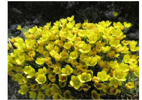
Saxifraga chrysantha.

botanical community began at the international level with national and regional strategies soon joining global efforts.