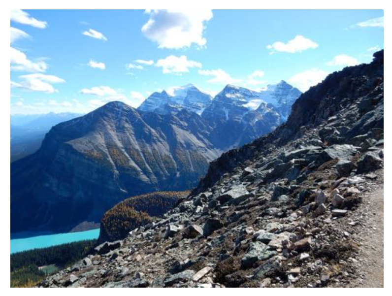
Lake Louise, Alberta Canada.