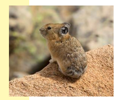
American pika.

The American pika ( Ochotona princeps ) is a small mammal that lives exclusively in the alpine and is dependent on it for its survival. The pika is closely related to rabbits and hares, thriving above treeline in rocky, mountainous habitats of talus and scree fields with nearby alpine meadows. Their frequent shrill calls are usually the first indication that one is nearby, using the calls to alert others to the presence of danger. American pikas are generalized herbivores, feeding on alpine plants and selecting their forage based on its nutritional value. They are well known for haying - collecting plants during growing seasons and caching them in large haypiles. The haypiles are moved into burrows to serve as a winter food source, with up to 30 species of plants in a single haypile. Long-term population trends of pikas are being studied to assess how the species responds to a warming climate, with many populations showing documented declines in number. Protecting the alpine means protecting the whole ecosystem, including these furry creatures that depend on the alpine to survive.