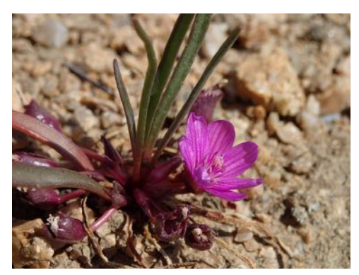
Lewisia pygmaea.