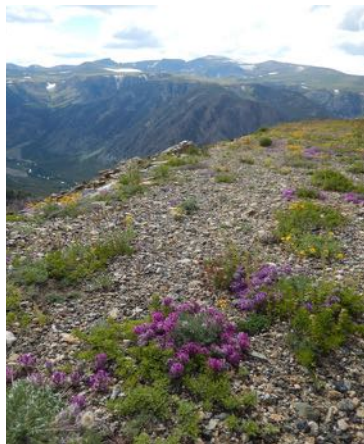
Beartooth Mountains, Montana.

It is not enough to just inform visitors about the need for alpine plant conservation 35 and the work being done by botanic gardens in this regard. 36 Supplying pathways to be active in conservation projects is essential. 37 An educated and motivated citizen can discern the accuracy of publicly distributed information and provide valuable personal support to conservation projects and organizations. Education and individual behavior are not sufficient to turn the tide on threats to alpine plant biodiversity and survival, however. Change must also occur at the legislative level. With education, environmental legislation can be proposed and supported by botanic gardens and citizens and, with their pressure, compel conservation actions by their legislators. 38