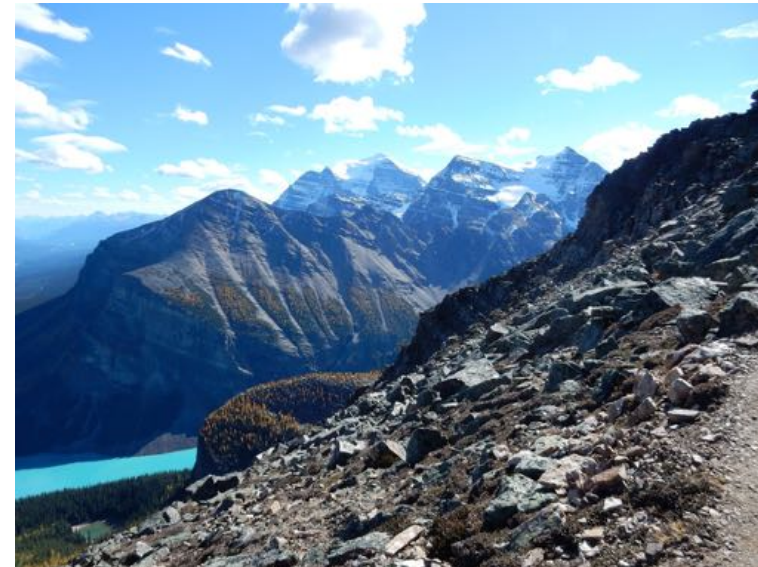
Lake Louise, Alberta Canada.

As noted in Target 8, ex-situ collections can take the form of plants, living tissues or seeds. Target 9 focuses on securing 75 percent of those with a G1-G3 rank in living and seed bank collections. A higher