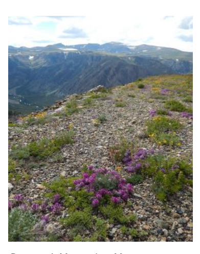
Beartooth Mountains, Montana.

their pressure, compel conservation actions by their legislators.<sup>38</sup>