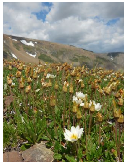
Dryas octopetala .

Areas where alpine botanical diversity is under-studied or poorly understood will be identified based on Target 1 and Target 3 mapping. Those areas needing further documentation and greater knowledge of the flora with the potential to improve conservation will be prioritized. Floristic inventories will be conducted through collections to enhance knowledge of alpine plant diversity and distribution. Specimens will be deposited in herbaria of the region where plants are collected. Specimen data will be shared broadly on publicly accessible platforms such as Global Biodiversity Information Facility (GBIF), 22 iDigBio, 23 Symbiota, 26 and the Southwest Environmental Information Network (SEINet). 27