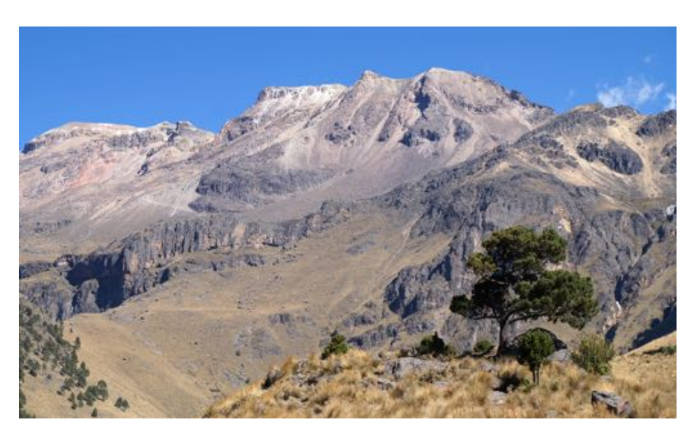
Treeline at Izta-Popo National Park, Mexico.