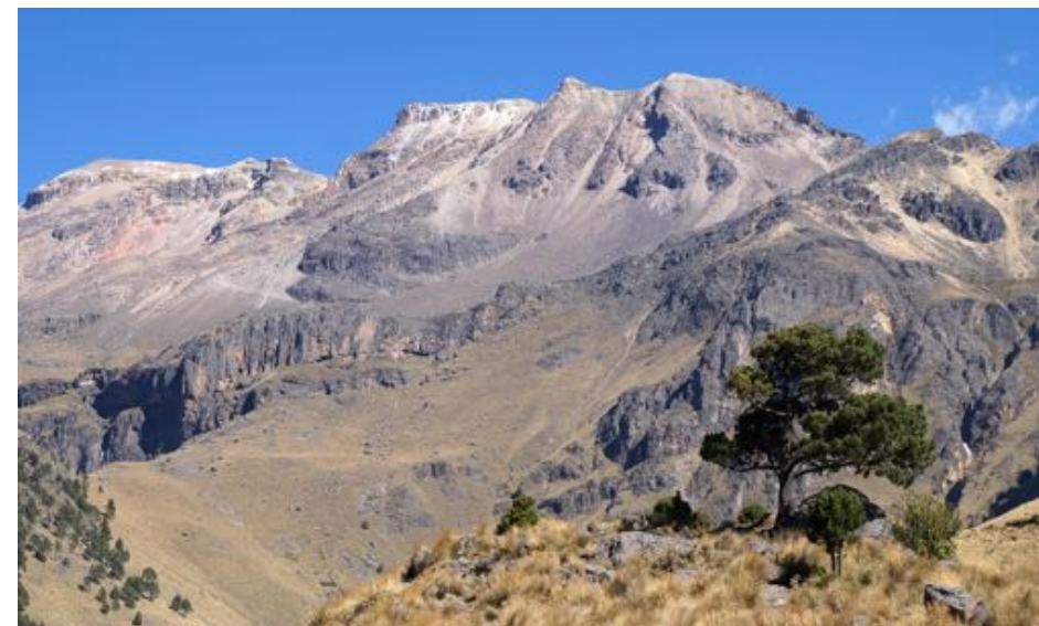
Treeline at Izta-Popo National Park, Mexico.