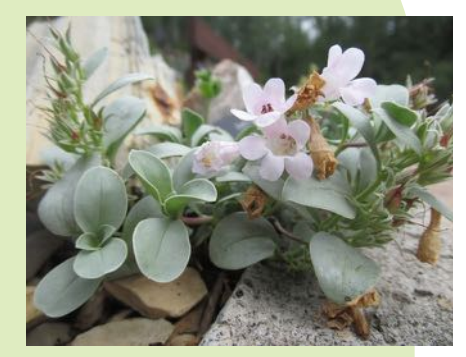
Penstemon debilis.

Situated at 8,200' (2,500m) elevation in the southern Rocky Mountains, Betty Ford Alpine Gardens is uniquely positioned to conserve alpine biodiversity in ex-situ collections, and currently has more than 3,000 species in its gardens from high elevation ecosystems all over the world, including more than 700 rare and threatened species. One of the most valuable and rare species is Penstemon debilis , Parachute Penstemon, a critically imperiled species endemic to Garfield County, CO. Only five populations remain in the wild, and they are at high risk of damage from oil and gas development. Betty Ford Alpine Gardens partnered with the Bureau of Land Management (BLM) to conduct census surveys, collect seed, and propagate this special plant to grow in the Gardens. This ex-situ collection helps to keep P. debilis from going extinct even if its habitat is further disturbed. About 80,000 species, or 30% of the world's plants, are grown in ex-situ collections in botanic gardens and arboreta, an important repository of diversity.