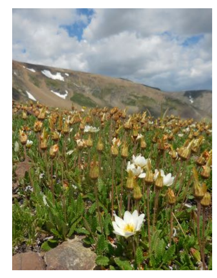
Dryas octopetala.