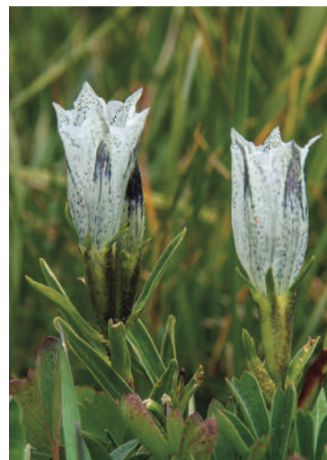
Gentiana algida . Photo Nanette Kuich