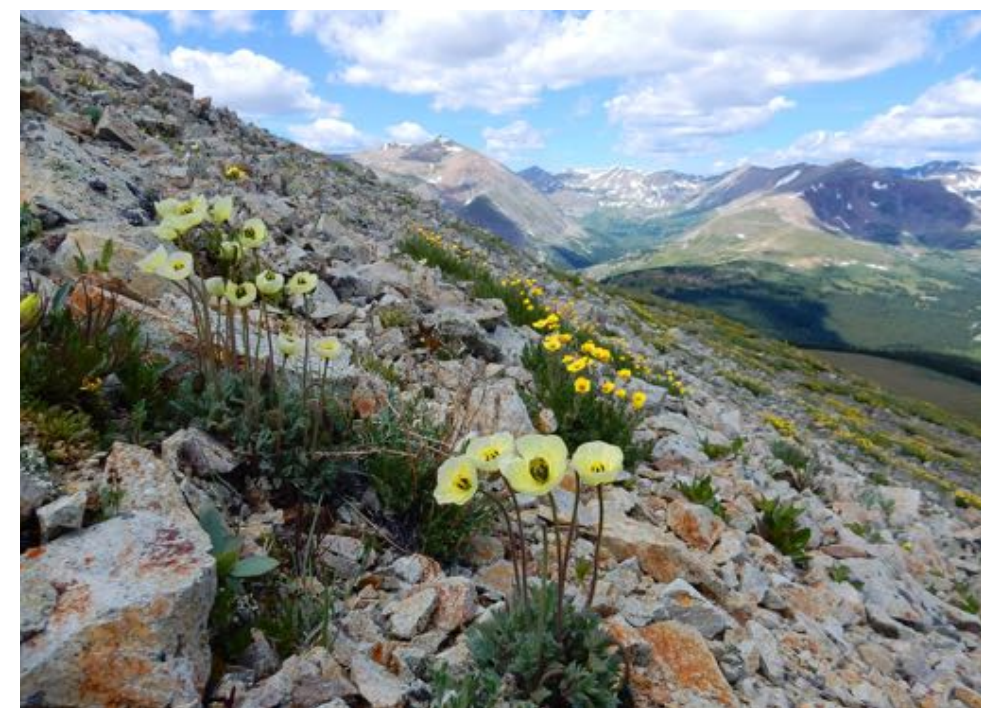
Hoosier Ridge, Colorado.

The alpine zone encompasses vegetation above the natural high altitude treeline.<sup>4</sup> Plants that inhabit the North American alpine zone are vulnerable to climate change. According to a 2019 special report by the United Nations Intergovernmental Panel on Climate Change and Land, anthropogenic warming is projected to shift climate zones poleward and upward in regions of higher elevation. Worldwide, mean land surface air temperature has increased 1.53°C from 1850-1900 to 2006-15. The report also states that desertification is expected to increase in semi-arid to arid drylands, including the U.S. Southwest that contains the Rocky Mountain alpine ecosystems. The result will be to lower ecosystem health, including losses in biodiversity. Invasive species are also likely to be aggravated by climate change.<sup>5</sup>