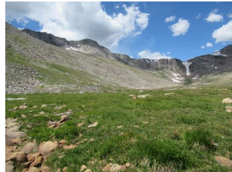
Summit Lake drainage, Colorado.

The botanical community is increasingly working to conserve plants and their habitats in the face of continuing loss of plant diversity. Worldwide, between 60,000 and 100,000, or one-third of all plants, are threatened with extinction due to habitat loss, fragmentation, and degradation. 1,15 Strategies to address this plant extinction crisis by the