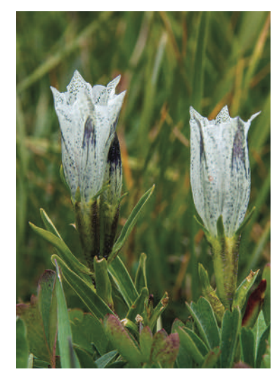
Gentiana algida.