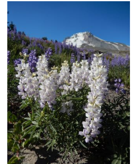
Lupinus sp. Mt Hood, Oregon.

Following Target 5 identification of IPAs, it will be verified that 25 percent of North American alpine plants are located in protected areas. Areas that are designated as IPAs with low protection designation and areas with high alpine flora diversity not included in IPAs will be targeted for improved protection. Scientists will conduct studies to further clarify life histories of species and floristic inventories that improve understanding of species distributions. Recommendations can then be made for fencing and road closures that enhance protection for individual species where appropriate. This can only be accomplished through collaborative efforts among botanic gardens, scientists and public land management agencies.