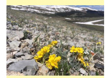
Physaria alpina.

Placing seeds in seed banks, below-freezing storage facilities, has become the primary method of ex-situ conservation for plants around the world. However, not all seeds are able to survive these dry, subzero conditions. Studies have shown that alpine species are short-lived in seed banks compared to lower elevation species even though they are adapted to extremely cold conditions. Denver Botanic Gardens received an Institute of Museum and Library Services award along with 11 other collaborating institutions for Endangered Exceptional Plant Research led by the Cincinnati Zoo and Botanical Garden. We are researching rare alpine species of Colorado to understand if they can be considered exceptional, requiring a different form of ex-situ conservation. This could have a dramatic impact on conservation strategies in the alpine.