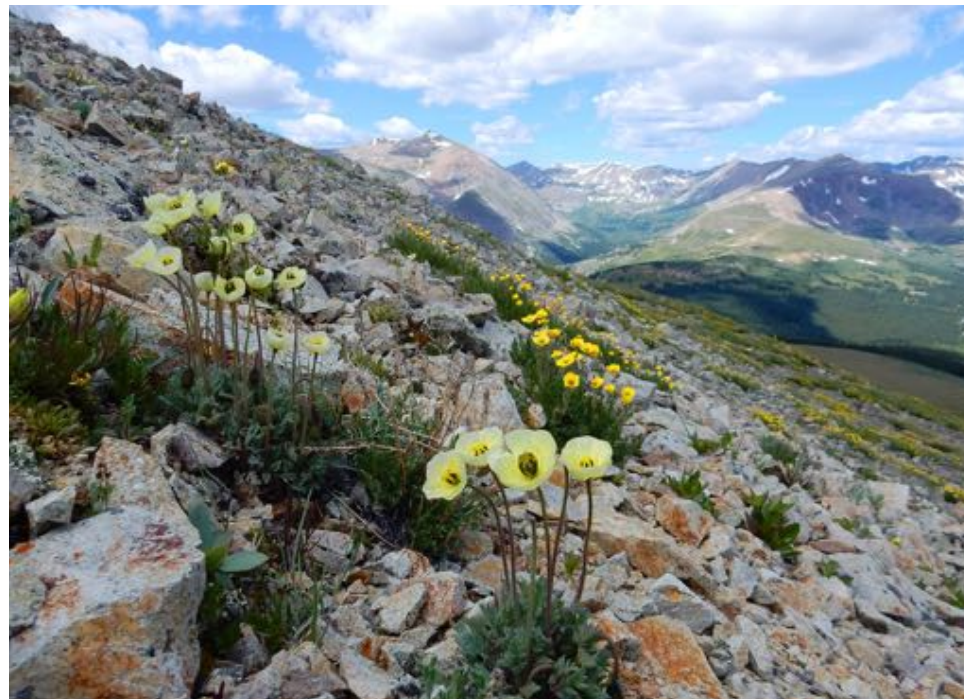
Hoosier Ridge, Colorado.

The alpine zone encompasses vegetation above the natural high altitude treeline. 4 Plants that inhabit the North American alpine zone are vulnerable to climate change. According to a 2019 special report by the United Nations Intergovernmental Panel on Climate Change and Land, anthropogenic warming is projected to shift climate zones poleward and upward in regions of higher elevation. Worldwide, mean land surface air temperature has increased 1.53°C from 1850-1900 to 2006-15. The report also states that desertification is expected to increase in semi-arid to arid drylands, including the U.S. Southwest that contains the Rocky Mountain alpine ecosystems. The result will be to lower ecosystem health, including losses in biodiversity. Invasive species are also likely to be aggravated by climate change. 5