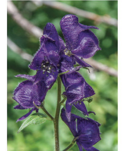
Aconitum columbianum .

ex-situ collection target of 90 percent is planned for species with a greater risk of extirpation or extinction based on conservation assessment and threat. Seed banking is considered the highest priority for ex-situ conservation.