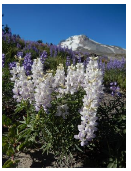
Lupinus sp. Mt Hood, Oregon.

Following Target 5 identification of IPAs, it will be verified that 25 percent of North American alpine plants are located in protected areas. Areas that are designated as IPAs with low protection designation and areas with high alpine flora diversity not included in IPAs will be targeted for improved protection. Scientists will conduct studies to further clarify life histories of species and floristic inventories that improve understanding of species distributions. Recommendations can then be made for fencing and road closures that enhance protection for individual species where appropriate. This can only be accomplished through collaborative efforts among botanic gardens, scientists and public land management agencies.