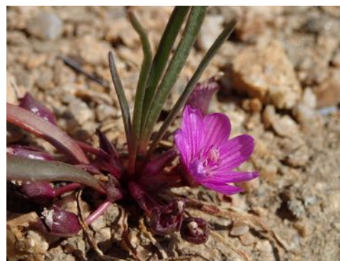
Lewisia pygmaea .