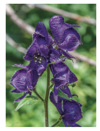
Aconitum columbianum.

Ten percent of threatened alpine plants will be placed in recovery and/or restoration programs following protocols such as those developed by the Center for Plant Conservation (CPC).<sup>32</sup> These programs constitute rigorously tested science-based protocols for conservation and in-situ re-introduction.