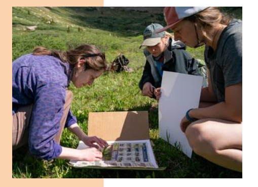
Collection of herbarium vouchers in the alpine.

phenological measurements to understand seasonal and recent phenological patterns, at Denver Botanic Gardens we use herbarium specimens to look back in time and measure how plant phenology has changed over longer periods. Our 2018 publication "Using Herbarium Specimens to Select Indicator Species for Climate Change Monitoring," explains our process of doing so. Studying species in Colorado's alpine areas, we analyzed herbarium specimen data to look at flowering time over the course of a 61-year period and its relationship to temperature and precipitation. We found that, on average, species that showed earlier bloom times than in previous years bloomed 39 days earlier at the end of the 61-year study than at the beginning. This indicates the sensitivity of these species to climate change.