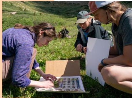
Collection of herbarium vouchers in the alpine.