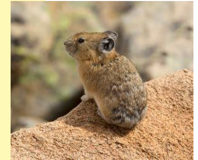
American pika.

The American pika ( Ochotona princeps ) is a small mammal that lives exclusively in the alpine and is dependent on it for its survival. The pika is closely related to rabbits and hares, thriving above treeline in rocky, mountainous habitats of talus and scree fields with nearby alpine meadows. Their frequent shrill calls are usually the first indication that one is nearby, using the calls to alert others to the presence of danger. American pikas are generalized herbivores, feeding on alpine plants and selecting their forage based on its nutritional value. They are well known for haying - collecting plants during growing seasons and caching them in large haypiles. The haypiles are moved into burrows to serve as a winter food source, with up to 30 species of plants in a single haypile. Long-term population trends of pikas are being studied to assess how the species responds to a warming climate, with many populations showing documented declines in number. Protecting the alpine means protecting the whole ecosystem, including these furry creatures that depend on the alpine to survive.