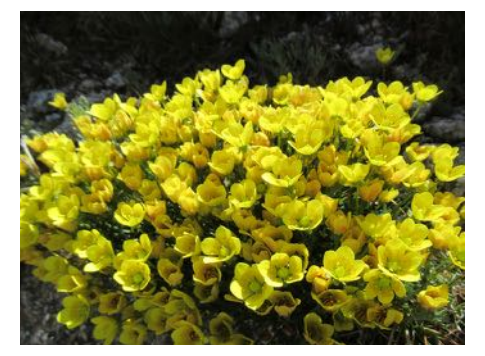
Saxifraga chrysantha. Photo Amy Schneider

Summit Lake drainage, Colorado. Photo Amy Schneider