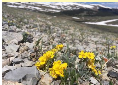
Physaria alpina . Photo Alex Seglias

Placing seeds in seed banks, below-freezing storage facilities, has become the primary method of ex-situ conservation for plants around the world. However, not all seeds are able to survive these dry, subzero conditions. Studies have shown that alpine species are short-lived in seed banks compared to lower elevation species even though they are adapted to extremely cold conditions. Denver Botanic Gardens received an Institute of Museum and Library Services award along with 11 other collaborating institutions for Endangered Exceptional Plant Research led by the Cincinnati Zoo and Botanical Garden. We are researching rare alpine species of Colorado to understand if they can be considered exceptional, requiring a different form of ex-situ conservation. This could have a dramatic impact on conservation strategies in the alpine.